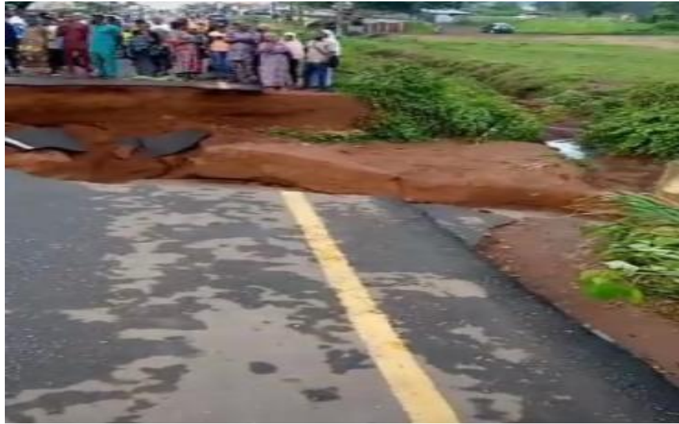
Figure 3: Road damaged as a result of flooding