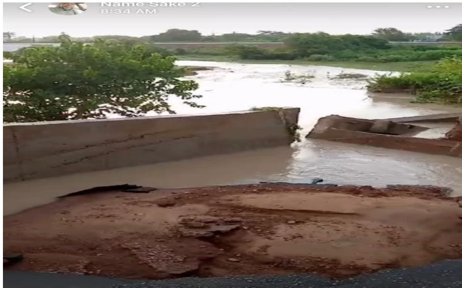
Figure 2: Water flowing beyond river bank during heavy rainfall