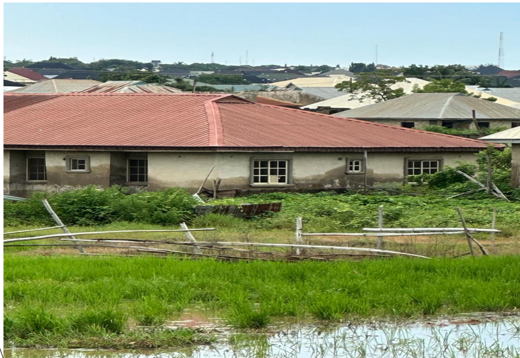
Figure 4: Flooded Residential Building